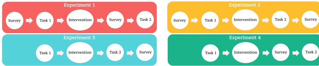
Figure 1: Experimental procedures in four experiments. Experiment 1 and 2 had both pre-intervention and post-intervention survey, Experiment 3 and 4 only had post-intervention survey.

interventions (as a pre-test) could bias them towards thinking about behaviors before engaging in the experimental tasks.